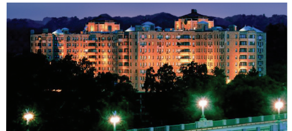
Venue: Omni Shoreham Hotel